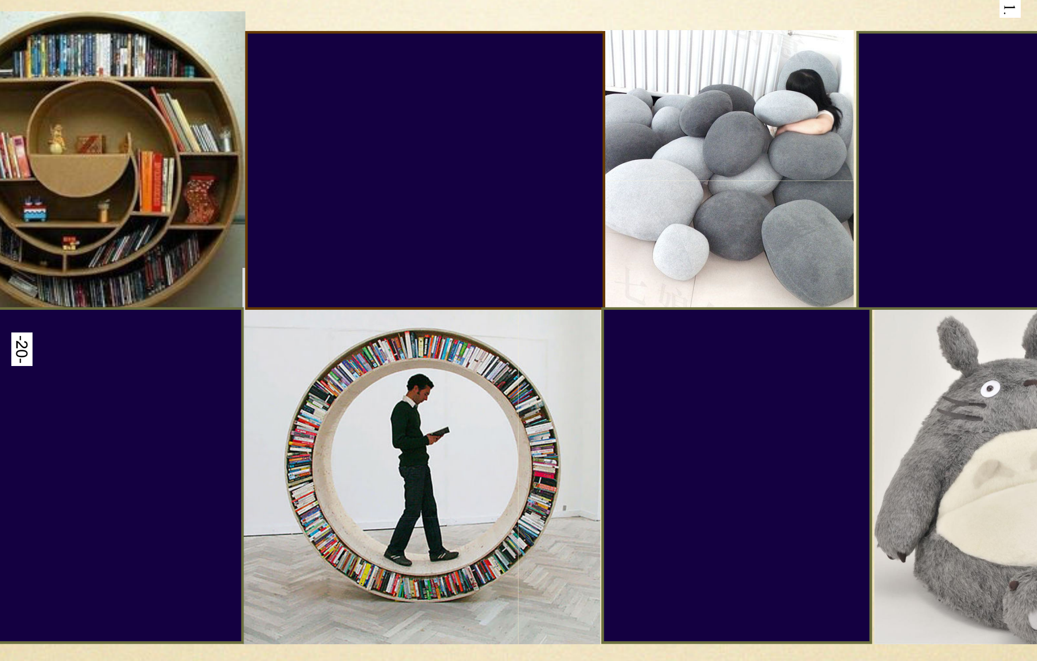
We wanted to make our library comfortable and