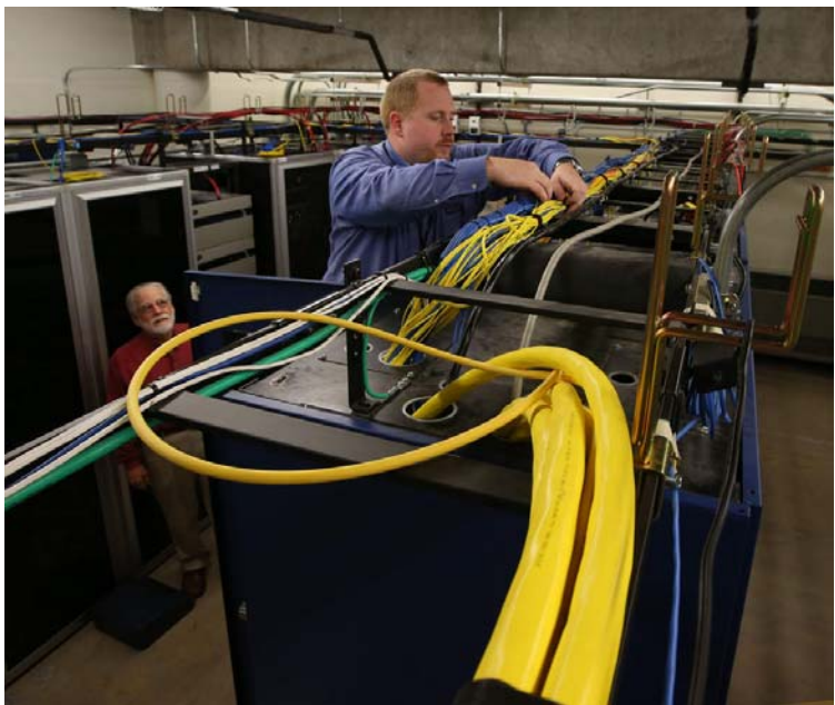
An ISP connects the fiber to a rack in the WIX.