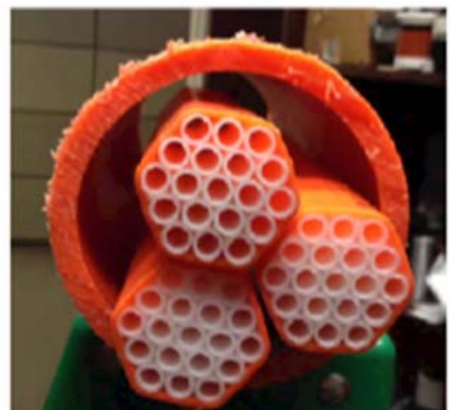
Microduct-the fiber lies in the small white, 'honeycomb' tubes.