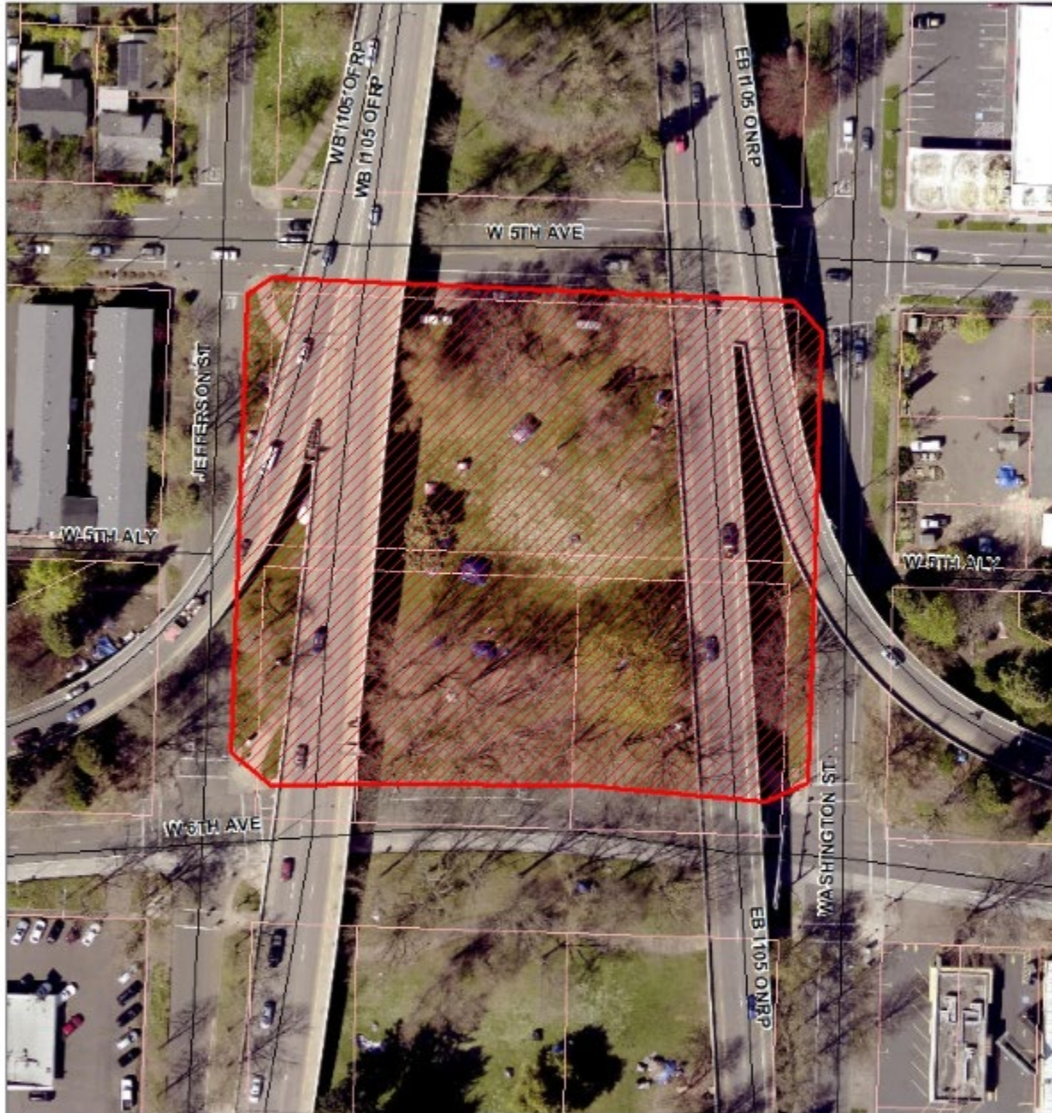
Exhibit A: WJ section 3 closure area