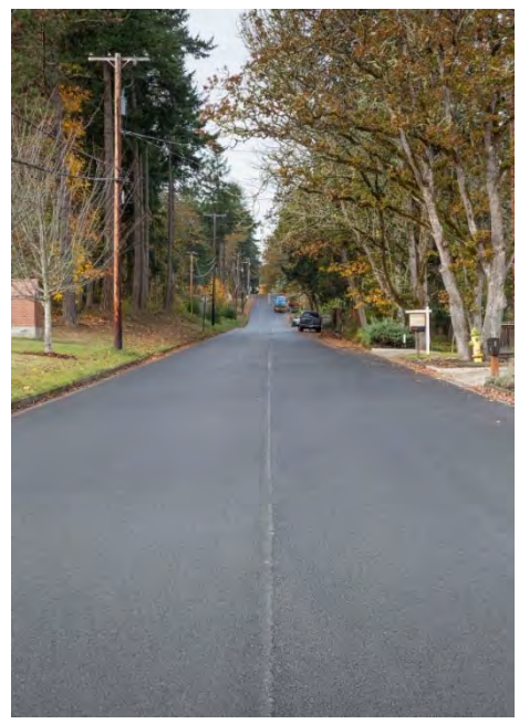
39<sup>th</sup> Avenue post-construction

Project Photos: See cover for a photo of Brae Burn Street