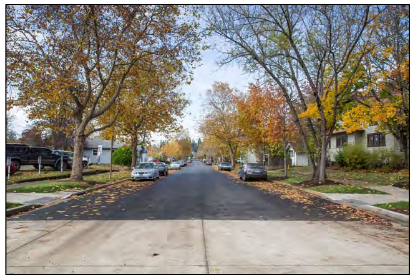
17th Avenue post-project

Additional Sources of Funding: Stormwater and wastewater utility funds paid for minor utility work.