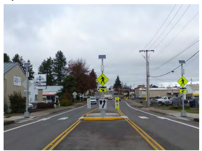
Rectangular rapid flashing beacon crossing installed on Bailey Hill Road