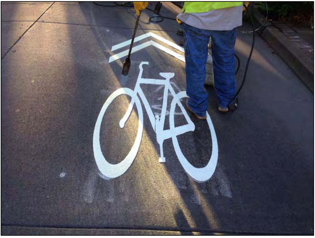
Installation of a shared lane pavement marking in 2015

The following pages are reports on individual projects. The total costs for each project listed are estimated as not all of the 2015 construction-related costs have been finalized as of January 1, 2016.