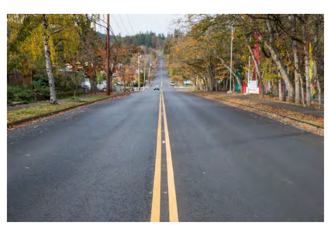
40th Avenue post-construction