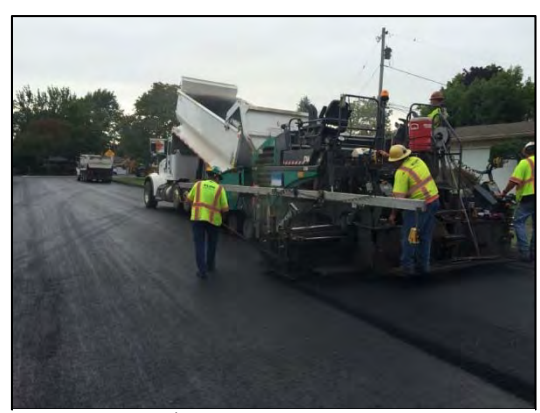
Paving on 19th Avenue

Reclaimed Asphalt Pavement (RAP) - Reclaimed asphalt pavement is the grindings from the existing pavement during the inlay process described above. While reclaimed asphalt materials can be used as base rock and shoulder materials, the most common and effective use of this material is to supplement virgin materials used to make new asphalt pavement and reduce the use of costly asphalt binder. In Oregon, it is common to specify up to 30% of asphalt pavement can be made up of reclaimed asphalt pavement. Other reclaimed asphalt materials, such as shingles, can also be used to replace virgin asphalt binder in pavements.