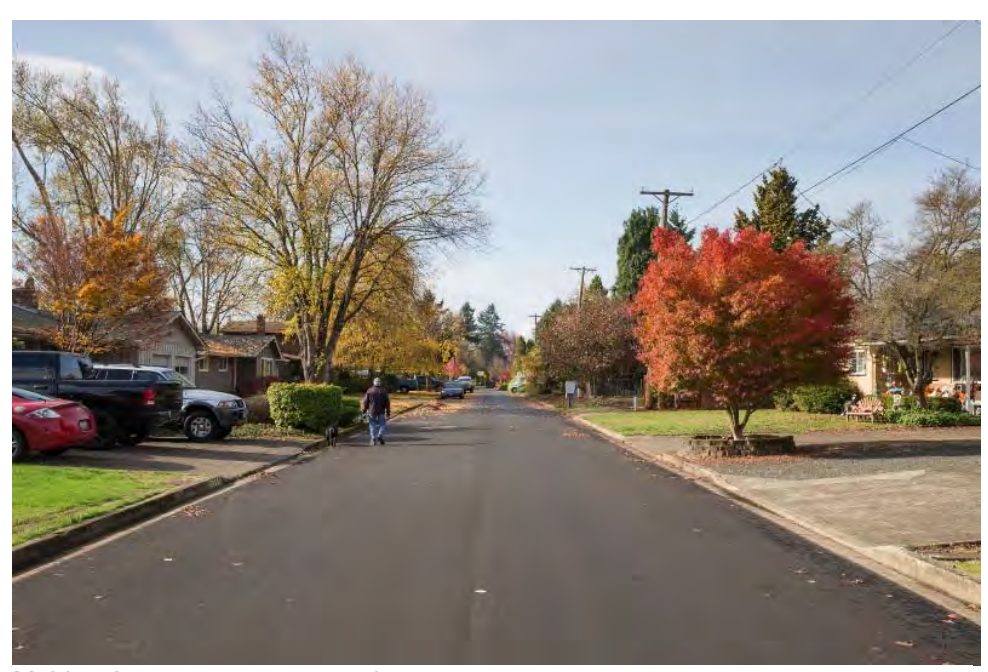
Mahlon Avenue post-construction