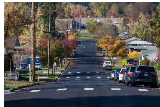
22<sup>nd</sup> Avenue post-construction