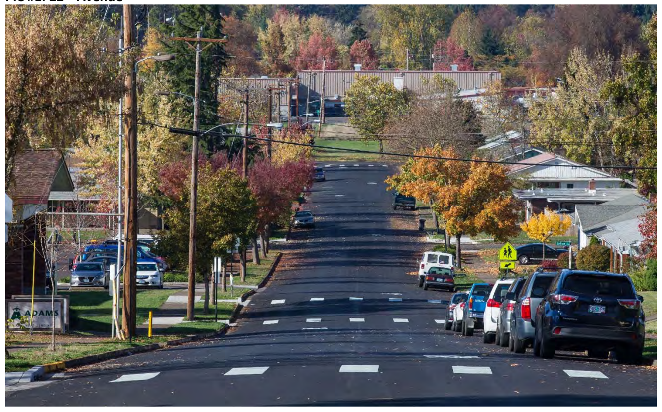
PIC #1: 22<sup>nd</sup> Avenue