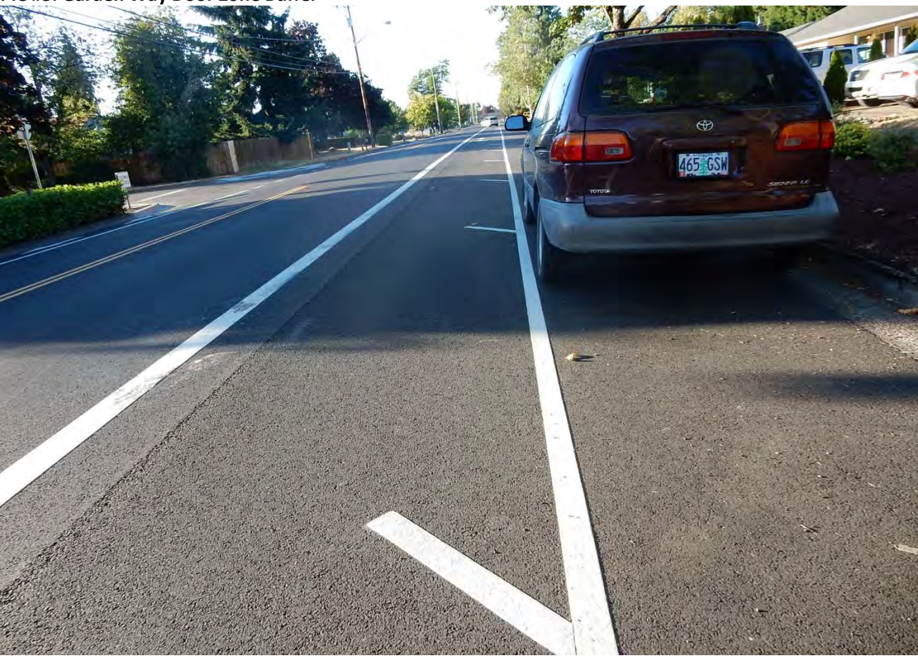
PIC #4: Willakenzie Bike Lane Buffer