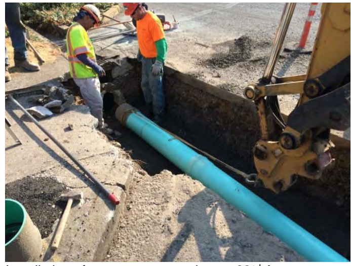
Installation of new stormwater pipe on 22<sup>nd</sup> Avenue

The use of street-repair bond funds is limited to the overlay or reconstruction of the driving surface of streets as well as to preserve existing integral elements of the street such as curbs, gutters, sidewalks, on-street bike lanes, traffic signals, street lights, medians, traffic calming devices, and other integral parts of a street preservation project. In addition, the City will allocate an annual average of $516,000 of the bond proceeds over a period of five years to fund bicycle and pedestrian projects. (Resolution 5063, Section D).