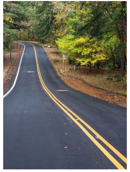
Timberline Drive post-construction