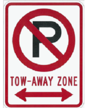
MUTCD R7-2 (L,R,D)