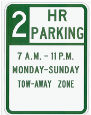
MUTCD R7-66 (L,R,D)