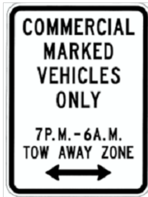
MUTCD R7-76 (L,R,D)